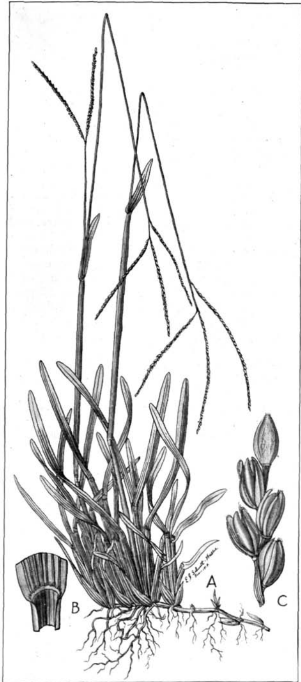
Carpet grass, Axonopus compressus (Swartz) Schlechtendahl. A, Entire plant; B, junction of blade and sheath, showing the structure of the ligule; C, branch with five spikelets, enlarged.