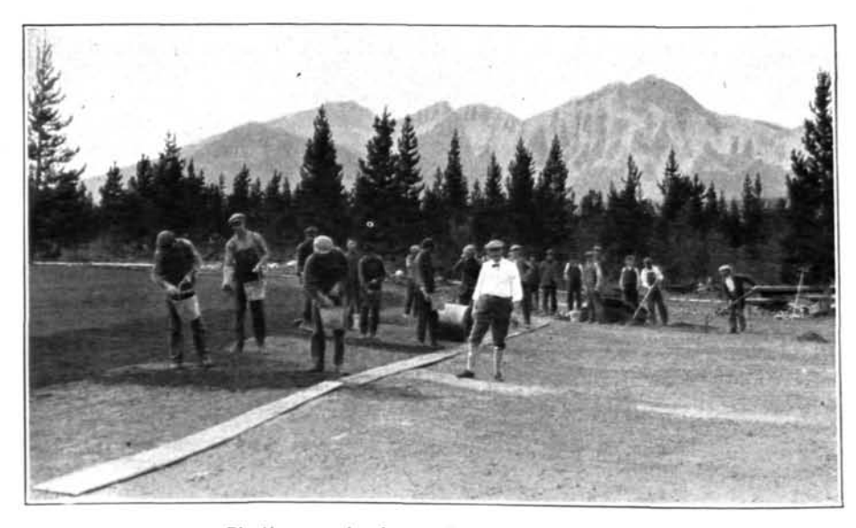
Planting creeping bent stolons at Jasper, Alberta.

The accompanying illustrations are interesting in showing the northward advance of the creeping bent putting green and the successful methods which have been worked out for the planting of such greens vegetatively on a large scale. The views are of the new course laid out by the Canadian National Railways at Jasper, Alberta, in the Canadian Rocky Mountains, about 1,200 miles northwest of Winnipeg. In one of the photographs the actual operation in the planting of the stolons is seen, and in the other a view of No. 18 green is given as seen from the tee 300 yards distant. The 18 greens were all planted in August of this year with stolons of the Washington strain of creeping bent.