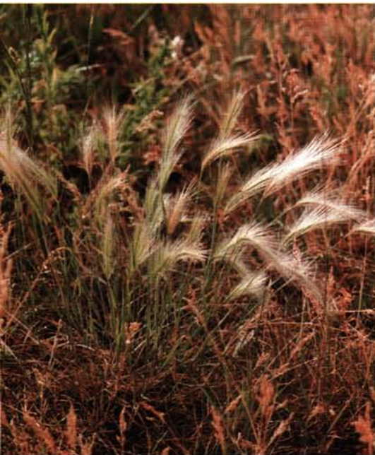
(Above) A close-up of meadow foxtail (Alopecurus pratensis). (Right) The native grasses provide a sharp contrast to the course, but blend in well with the rugged Colorado scenery. The native areas have excelled since stakes and rope were installed as traffic control measures.

Naturally, we are not the only ones experimenting with this concept. Superintendents and officials at other golf courses who are trying to implement water conservation techniques should be commended. If the American golfer accepts the links style of the courses of the British Isles, and if such a course benefits our earth, then let's develop more of them.