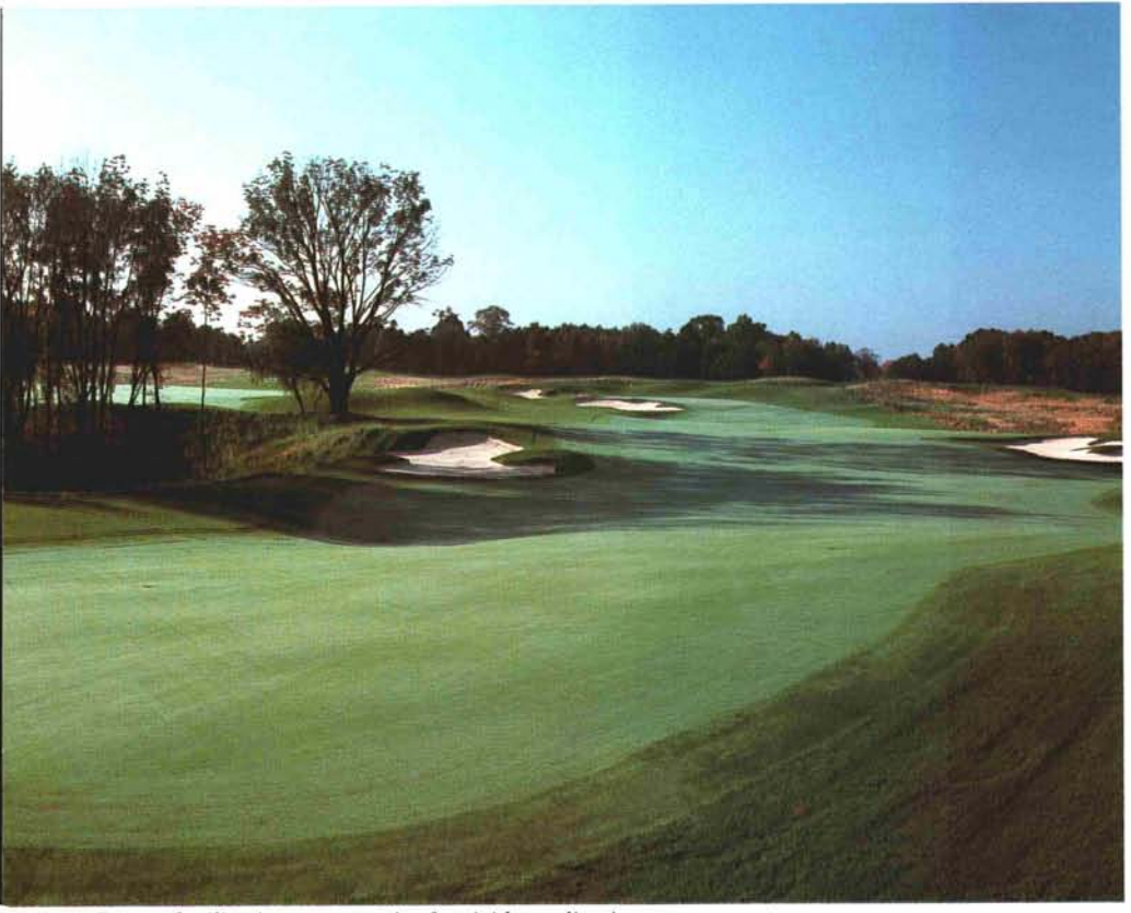
Proper fertilization, preventative fungicide applications, proper water cycles, and mulching of slopes are critical for a successful grow-in.

alarmed if annual weeds germinate after the Siduron wears off. The desired turf will be strong enough to compete against the weeds, and the weeds can be sprayed out easily after the turf is established.