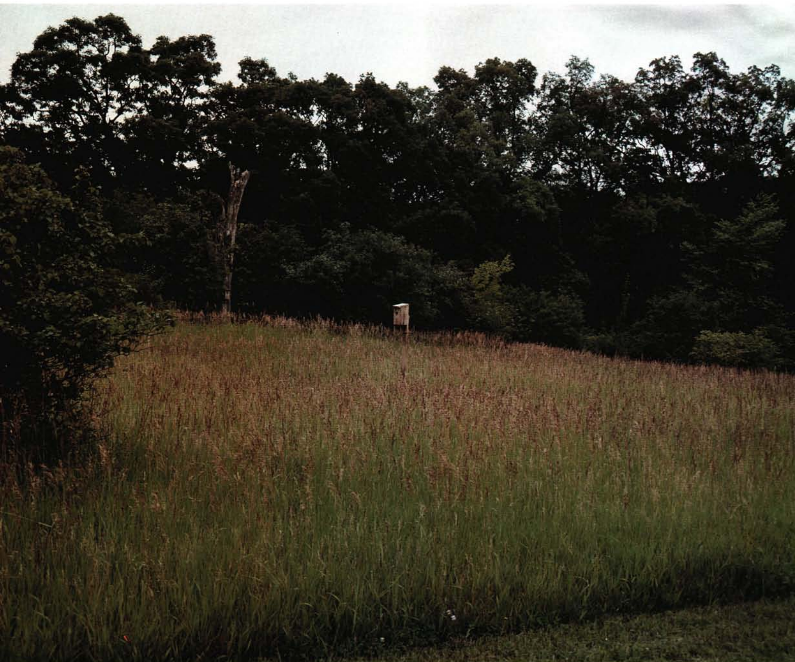
Nest boxes not only provide homes for resident birds, but also send a subtle message about environmental awareness.

guidelines to insure ongoing commitments from those certified golf courses.