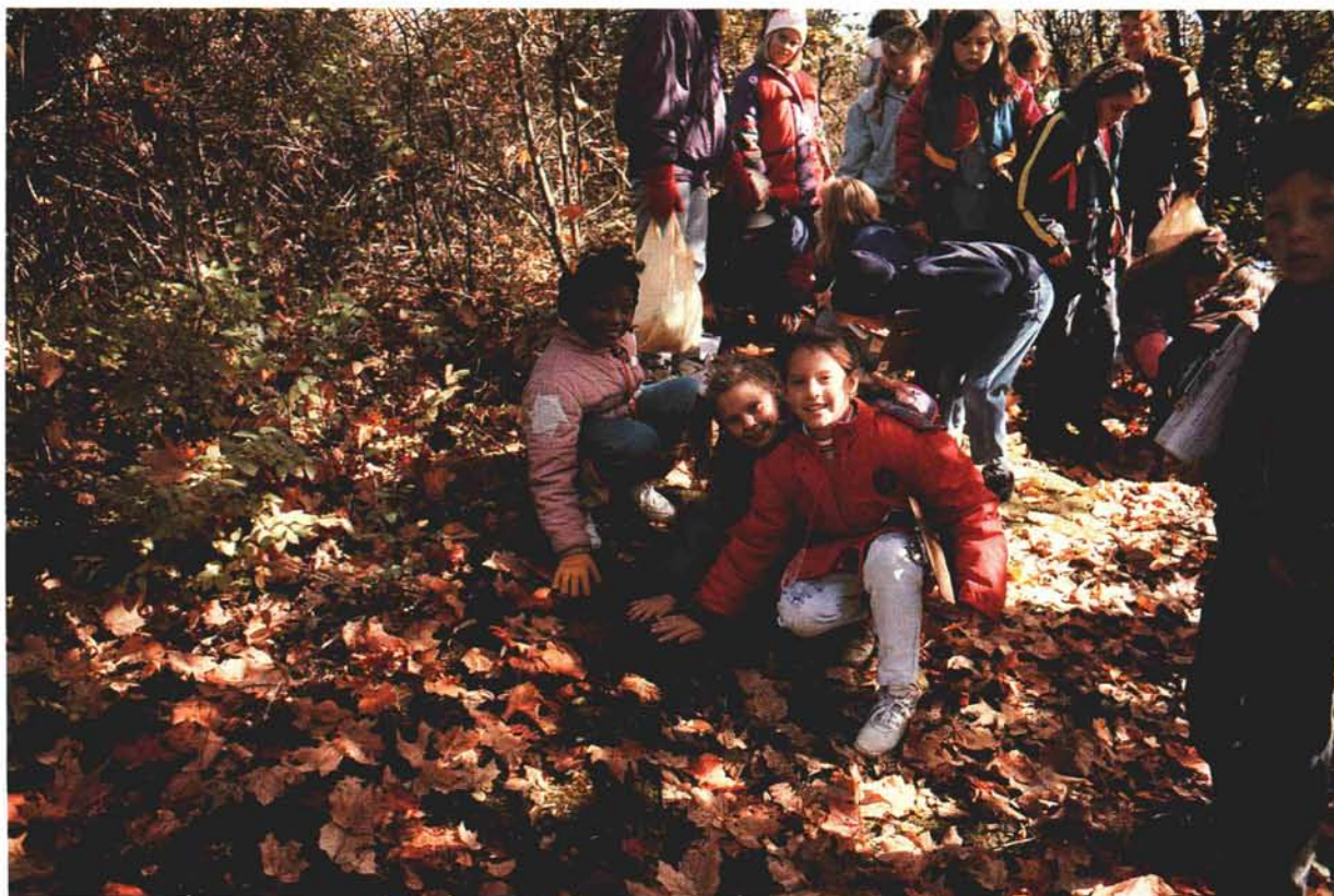
A golf course provides school-children an opportunity to explore and be intrigued by nature. You may even recruit a future horticulture student.

"The longer I live, the more I realize the impact of attitude on life. Attitude, to me, is more important than facts. It is more important than the past, than education, than money, than circumstances, than failures, than successes, than what other people think or say or do. It is more important than appearance, giftedness, or skill. It will make or break a company . . . a church . . . a home. The remarkable thing is we have a choice every day. We cannot change our past . . . we cannot change the fact that people will act in a certain way. We cannot change the inevitable. The only thing we can do is play on the one string we have, and that is our attitude . . . I am convinced that life is 10 percent what happens to me and 90 percent how I react to it. And so it is with you . . . we are in charge of our attitudes."