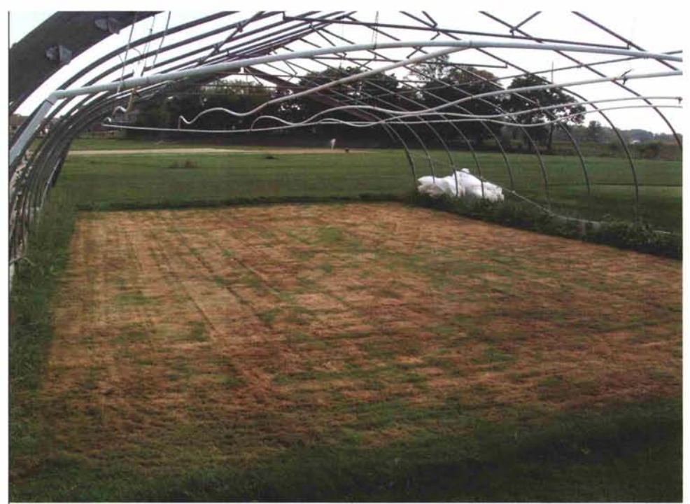
The so-called "chamber of death" resulted in damage to creeping bentgrass clones after inoculation with Pythium disease in August 2005.

The 600 clones were transplanted into a perennial ryegrass fairway at the O.J. Noer Turfgrass Research and Education Facility new Verona, Wis., in June 2003. The fairway was covered with a metal-