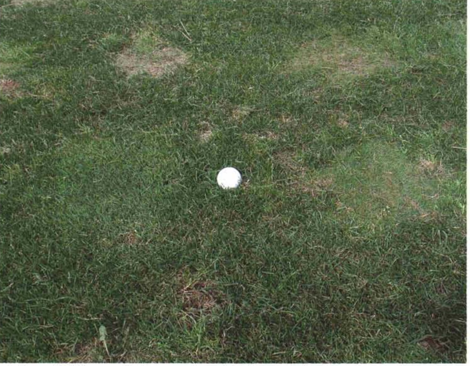
In August 2005, four creeping bentgrass clones planted in a research trial on a ryegrass fairway at Gateway Golf Club (Land O' Lakes, Wis.) show differences in genetic resistance to dollar spot.

Dollar spot ratings were considerably more consistent across ratings made at different locations or years. This was probably due to the use of a constant source of inoculum at all locations and the fact that dollar spot is caused by only one organism.