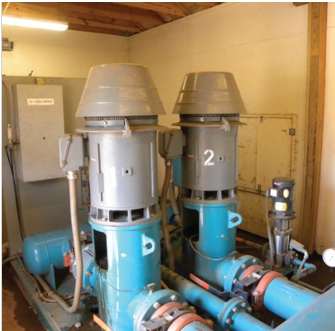
It is estimated that pump stations use 25-50% of the total electricity for a golf facility.

In the article entitled “Energy Use on Golf Courses, Part 1: Energy Generation and Delivery,” Andrew Staples points out that a typical pumping system will account for 25% to 50% of a golf course’s energy use (Staples, 2009). This is eye-opening information. Most turf managers in charge of irrigation scheduling have focused on the least amount of time to apply needed water to golf course turf. However, it is likely that, as a result of this recession, the question will be reframed to, “What is the most energy-efficient way to manage the delivery of water to the golf course and still meet the expectations for the facility?” If your facility has not thought about irrigation in this way, there is ample opportunity to reduce electricity costs. Be forewarned: This is a complex topic and one that will likely require the use of an irrigation consultant, but in the long term, the investment in time and