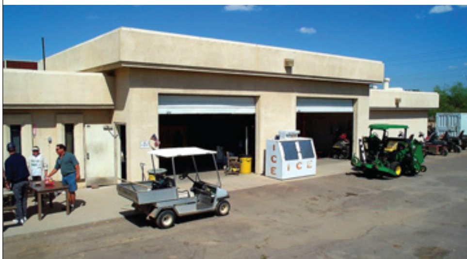
Conducting an energy audit is just as important in the maintenance facility. Don't overlook this critical opportunity to improve efficiency.

and inefficiencies are uncovered. The beauty of energy audits is that, in most cases, any changes made to reduce energy demand in the first month will not only save money in that month, but these savings will recur over time. Therefore, there can be a big payoff for the time spent on energy audits. A second reason to conduct an energy audit is the fact that it is easy to begin. A final reason is that, over time, there will be more government regulation of power consumption, not less, and any steps taken now will be helpful should regulations increase in the future.