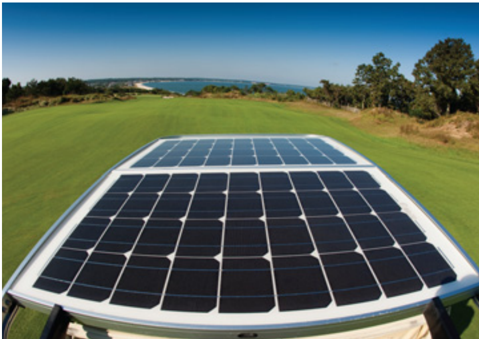
Solar panels can help reduce energy consumption by 50-75% and extend the life of cart batteries significantly. Sebonack Golf Club in Southampton, N.Y., has taken a leadership role and embraced the technology for their golf cart fleet.

compact fluorescent bulbs. If long fluorescent bulbs are used, replace them with more energy-efficient Super T-8 lighting.