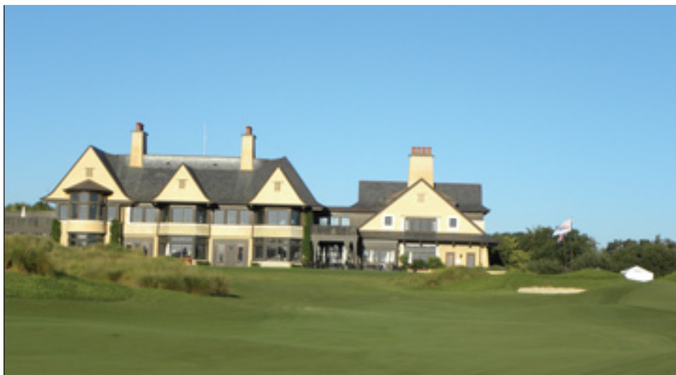
Although modern clubhouses have been constructed with energy efficiency in mind, there are still opportunities to reduce energy costs on these buildings.

The reasons why it is beneficial to conduct an energy audit at your facility are largely self-evident. Most industries, including golf, have sought ways to reduce any and all costs during the recent recession. Difficult times often lead to more careful scrutiny of budgets,