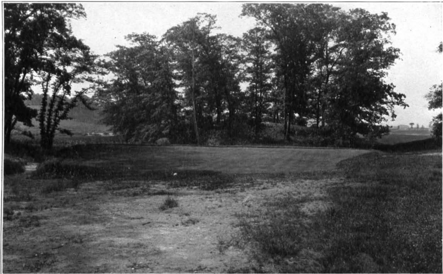
Hole No. 7, Metacomet Golf Club. Close-up view of putting green.