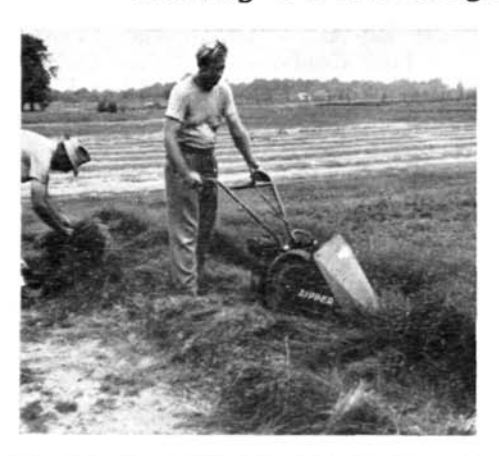
Mowing U-3 Bermudagrass hay for vegetative planting. The fresh hay is good planting material, although the rhizomes and crowns are better. These photos by Bureau of Plant Industry simply show one way to plant U-3 Bermudagrass into established turf without interfering with the use of the area.