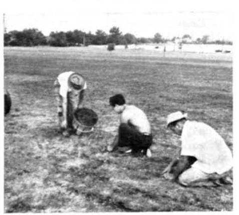
Fresh-cut Bermuda hay is dropped along furrow and pushed down until three-fourths or more of the material is buried. An edging tool could be used to force cut grass into furrows. Operation is completed by rolling furrows with wheels of tractor, followed by watering to insure catch.