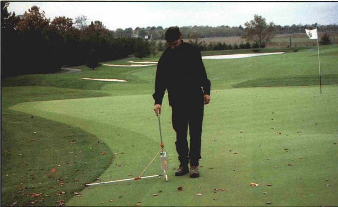
(Left) The tool has been modified slightly since its inception. The collars are checked periodically during the year. If major changes are necessary, they are performed in the fall.

collars begin to widen while greens become smaller.