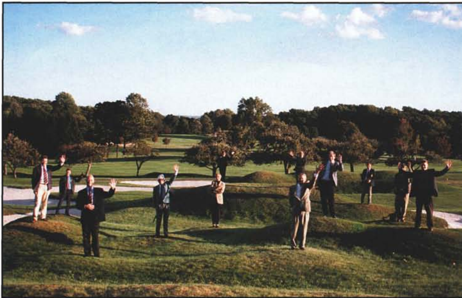
Members of the British Association of Golf Course Architects paid a visit to Golf House in early October to visit with members of the Green Section staff over a two-day period. Among the topics discussed were green construction methods, the cost of golf course construction, environmental issues, and liability concerns. Representatives from Belgium, Holland, Iceland, Spain, and the U.K. gave presentations about how golf is expanding in their countries. The BAGCA is in the process of developing guidelines for golfer safety as it relates to course design and construction, a topic of interest to the golf industry worldwide. BAGCA members are seen enjoying a tour of the Somerset Hills Golf Club in Bernardsville, N.J.