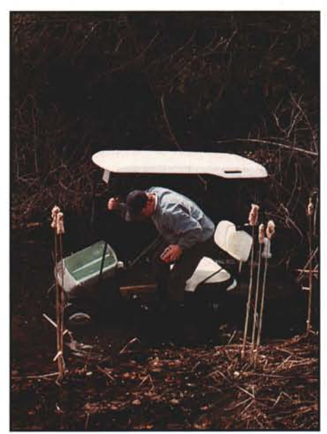
Keep your golf course heading in the right direction by reviewing potential liability situations. See page 8.