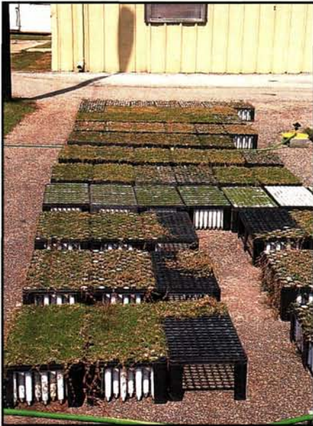
The USGA-funded breeding projects are directed at developing grasses with reduced water and pesticide requirements. See page 8.

Cover Photo: Despite being classified as hazards, bunkers are expected by today's golfers to be as well constructed and maintained as the other parts of the course.