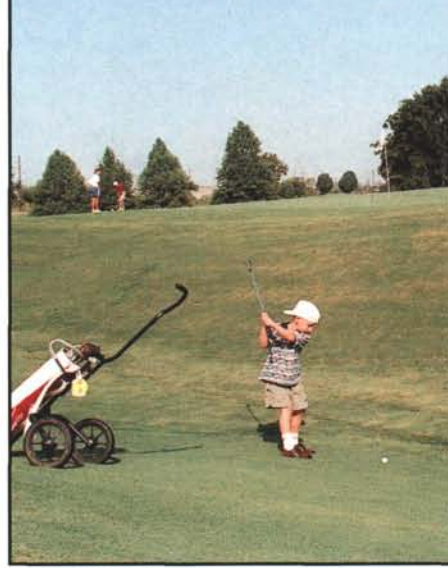
One of the keys to making golf affordable to the many young players taking up the game is to design courses that can be easily walked. See page 10.