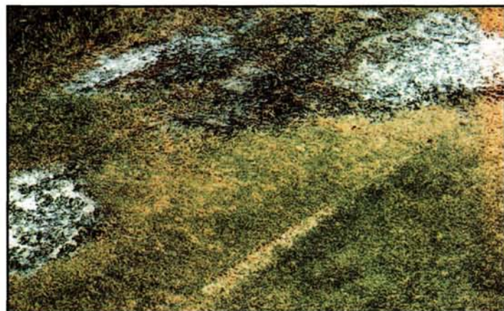
Saline-sodic soil with high total salts (whitish crust) and high Na causing a black appearance. This site had a soil ECe of 26 to 85 \text{d Sm}^{-1} and SAR 32 to 67.

• Equipment for water treatment can be an expensive investment costing from $8,000 to $30,000, depending on