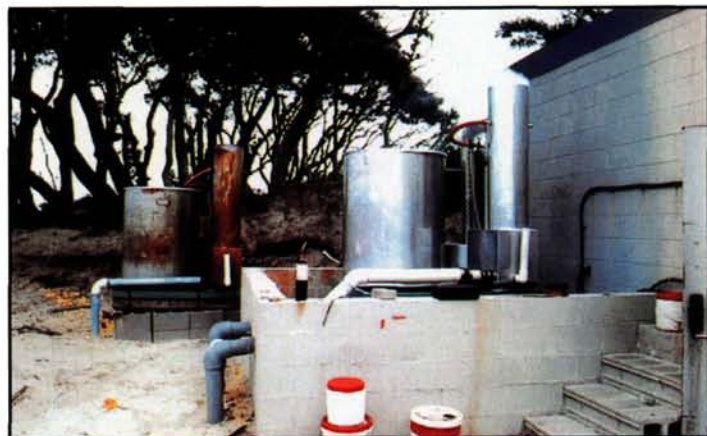
This sulfurous generator burns elemental S to create \text{SO}_2 , which reacts with water to form sulfurous acid, \text{H}_2\text{SO}_3 .