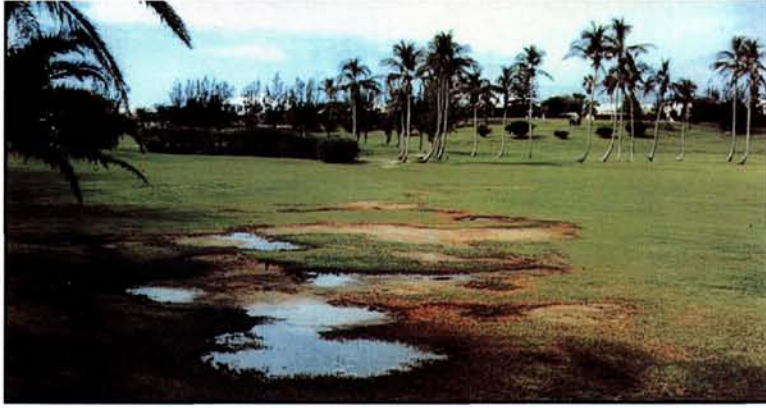
Poor water infiltration into a sodic soil resulting in standing water in low areas.

the type of equipment and treatment necessary.