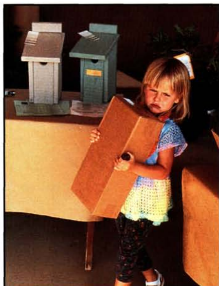
A nest box program can involve club members and the community in raising environmental awareness. See page 18.