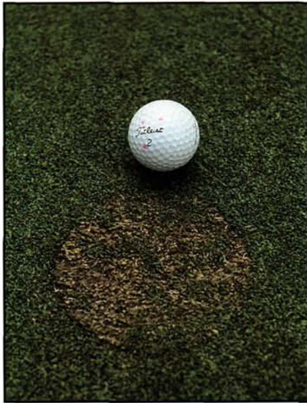
Scalped plugs can be avoided. Technique can make the difference. See page 6.

Cover Photo: Agronomic practices such as vertical mowing are instrumental in providing good seed/soil contact for establishment of the overseeding grasses.