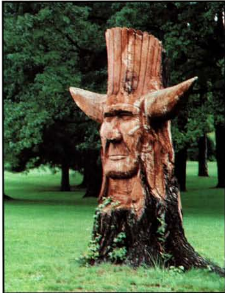
Sometimes the stump of a tree removed for agronomic reasons can be put to artistic use on the golf course. For more about dealing with trees, see page 1.