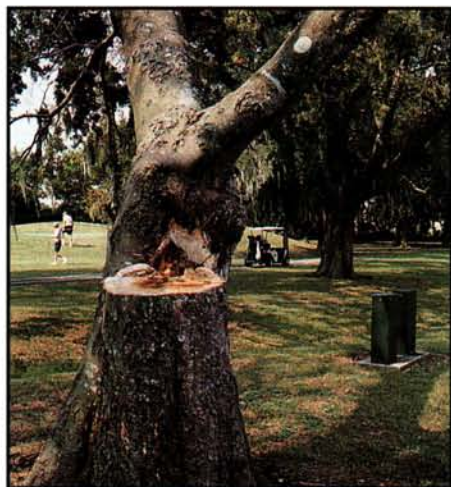
Unless manually removed, it is probable that this tree will fall and damage the irrigation controllers below. See page 13.