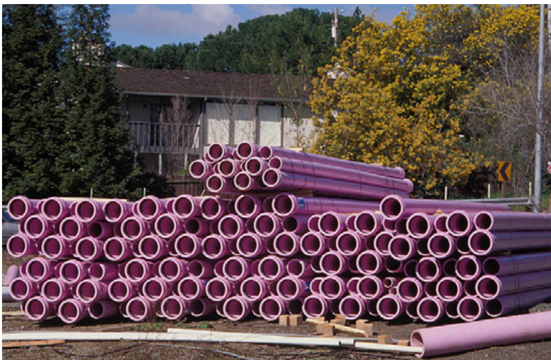
The color purple is now widely accepted as the official color for recycled water conveyance equipment. Almost all irrigation system components are now available in purple.

of adequate water within the rootzone. For such osmotic stress symptoms, the term physiological drought is often used. High salinity can also cause some ions (e.g., sodium) to be absorbed by the plant in high enough quantities to cause tissue burn or to compete with other essential elements, creating nutritional imbalances. In most cases, injury