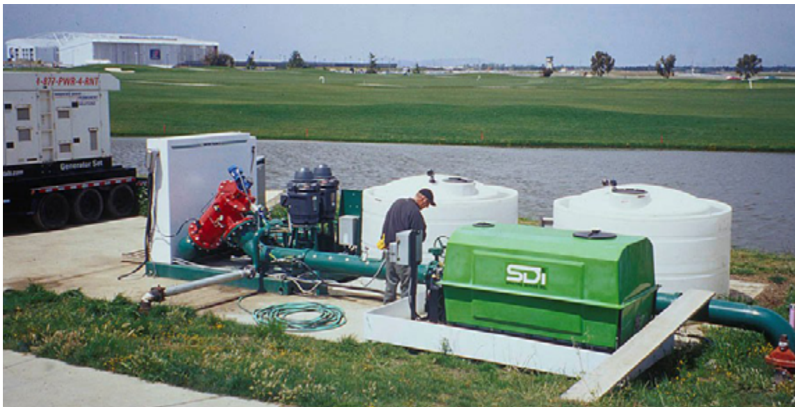
Applying soil and water amendments such as gypsum (calcium sulfate), calcium chloride, sulfur, and sulfuric or N-phuric acids can reduce the negative effects of sodium and other salts. There are many different amendments and equipment available to effectively inject them into an irrigation system.

bicarbonate contents), better-quality water. Although the resulting sodicity will vary according to the amount of sodium/bicarbonate present in the two waters, water quality will improve in proportion to the mixing ratio.