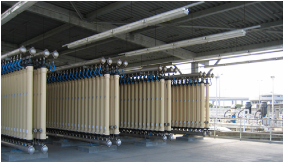
Advanced wastewater treatment involves processes and equipment similar to those used for potable water treatment. Advanced treatment is often referred to as “tertiary treatment.”

and ground water together are being rapidly depleted due to industrial and agricultural use and direct human consumption. Population growth accelerates and exacerbates the potable water scarcity. Also, human activities continue to pollute much of earth’s waters, contributing to potable water scarcity. It is estimated that by the year 2025, earth’s population will pass 8 billion, with the great majority of the population living in large metropolitan areas. Most of the world’s turfgrass (and other landscape plantings) is also in urban centers, where it competes with human consumption and food production for access to high-quality irrigation water.