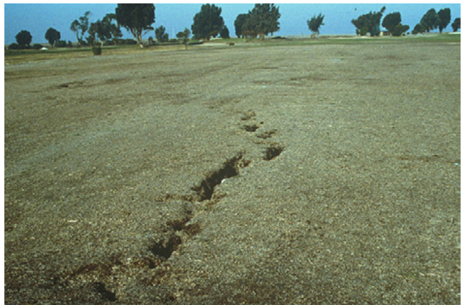
In most cases where significant drought conditions occur, turf and landscape irrigation is not a priority for municipalities, resulting in parched stands of grass.

“Recycled water” refers to water that has undergone one cycle of (human)