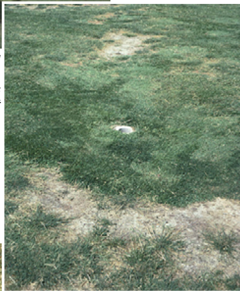
(Below) In early stages of salt buildup under saline recycled water irrigation, the stress caused by salinity may leave thinned, weak grass vulnerable to other stresses like heat, drought, or disease infection.