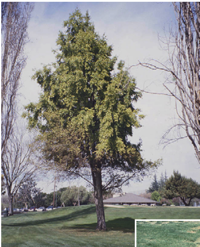
Under saline recycled water irrigation, injury to landscape plants other than turf often appears on lower foliage due to its direct contact with irrigation water.