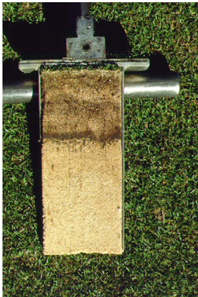
On golf greens especially, reducing or removing accumulated surface organic matter (thatch) is crucial under recycled water irrigation. Thatch and mat layers stop the flow of water through the soil and impede leaching of salts.

Blend irrigation waters. Frequently, poor-quality water can be used for irrigation if better-quality water is available for blending. The two waters can be pumped into a reservoir to mix them before irrigation. Although the resulting salinity will vary according to the type of salts present and climatic conditions, water quality should