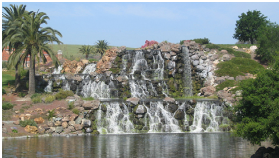
At some sites, especially golf courses, where recycled water is used for irrigation, creative water features are incorporated into the landscape design to control algae growth in ponds.

Recycled water can also be high in nutrients, whose economic value may be an important consideration. Nitrogen, phosphorus, and potassium, all of which are essential to turfgrass growth, are the primary nutrients present in most recycled waters. Even if the quantities of nutrients in a given recycled water are small, they are efficiently used by turfgrass because they are applied frequently and regularly. In most cases, turf obtains all the phosphorus and potassium and a large part of the nitrogen it needs from recycled water. Sufficient micronutrients are also supplied by most recycled