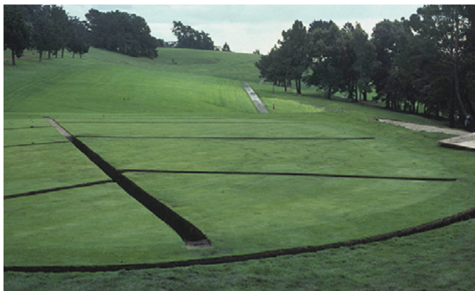
Wherever recycled water is used for irrigation, good drainage is essential. Drainage can be natural or can be improved by installation of tile drains.