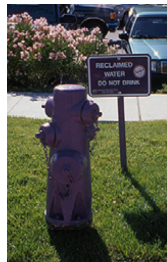
Presently, most of the turfgrass irrigated with recycled water grows on golf courses, sports fields, and parks. However, recycled water irrigation is increasing on other urban common spaces.

contact with human pathogens. The color purple is now broadly accepted as the official color for recycled water conveyance equipment. Almost all irrigation system components are now available in purple, including pipes, sprinkler heads, valves, and irrigation boxes.