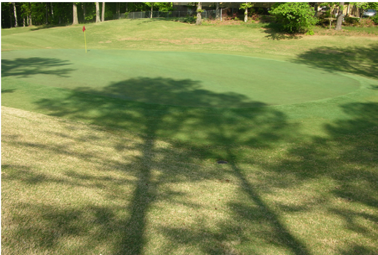
Shade from trees surrounding a putting green vary throughout the year due to the changing angle of the sun. The quantity of light for plant growth not only changes based upon shade, but on the time of day.

under varying levels of shade. They found that plots with four hours of sun (12 noon to 4 pm), applications of Primo, and a 3/16" height of cut, produced acceptable turf quality at a DLI of 22.1. These researchers concluded, "Therefore, applying a plant growth regulator that inhibits gibberellic acid and raising mowing heights will improve the growth, quality, and performance of ultradwarf bermudagrass greens in shade ( Bunnell and McCarty, 2004b )."