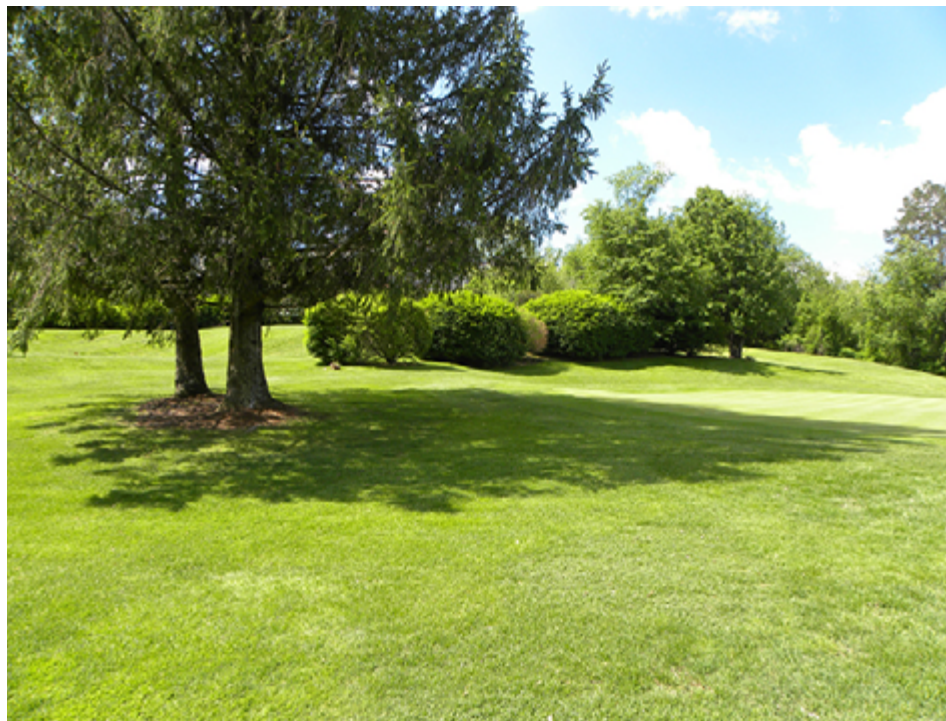
Planting trees too close to a putting green can result, years later, in levels of shade that hinder turfgrass growth, particularly ultradwarf bermudagrasses.

A golf course superintendent can identify the putting greens that historically have battled issues caused by shade. It is common on some greens that there is only a small corner or area that may receive more shade than other parts of the green. It is a good idea to take two or three measurements