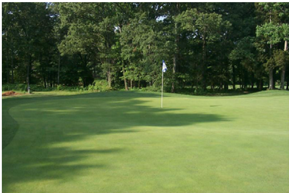
Because shade levels vary throughout a putting green, it is important to measure light levels at different locations on a given putting green.

Is it necessary to measure every putting green? Probably not. Start first