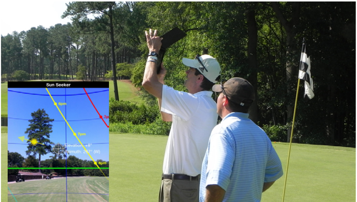
Affordable technologies are available for in-field use to more effectively observe the path of the sun and identify trees that block sunlight. When only a few trees may be an issue, a superintendent using the Sun Seeker can identify the trees that block sunlight to a putting green and the approximate length of time these trees cause shade.

intensities cause degradation of the existing chlorophyll, while low temperatures impair chlorophyll synthesis. The result is typical winter discoloration since the chlorophyll degradation rate exceeds the rate of synthesis” (Beard, 1973).