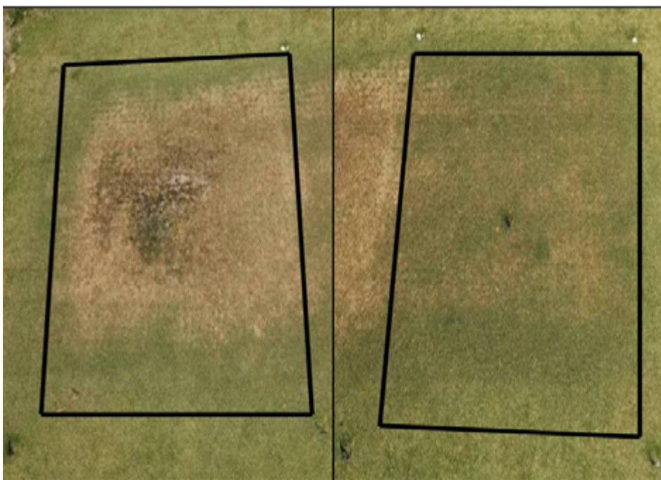
Diamond zoysiagrass putting green responses to shade and Primo. Left, 90% shade without Primo. Right, 90% shade with Primo.