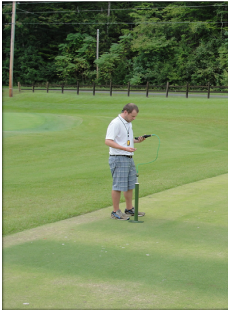
TruFirm readings were taken monthly to measure Diamond zoysiagrass putting green surface firmness.

One of the advantages of converting to an ultradwarf bermudagrass putting green is its relative ease through no-till and quick establishment methods. A potential concern of using Diamond zoysiagrass as a putting green is its slow establishment rate. Currently, there is a lack of research to explore establishment techniques of Diamond zoysiagrass. However, previous research at Clemson demonstrated that Diamond can be established from sprigs in one growing season and meet putting green expectations within 12 weeks. The time required for estab-