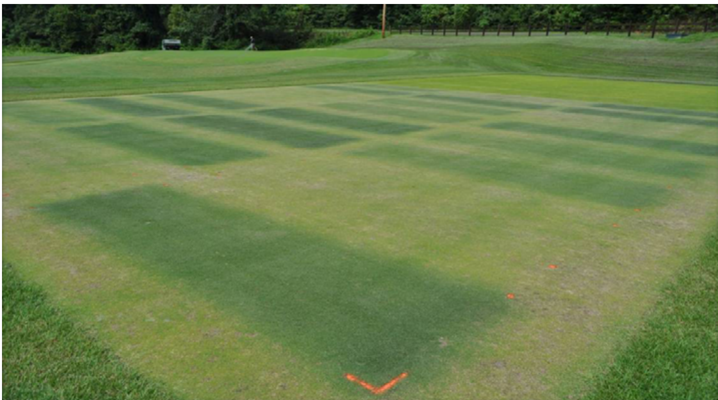
Variations in Diamond zoysiagrass turf quality due to nitrogen fertility levels were apparent throughout the growing season. Darker green leaf tissue on the Diamond occurred with weekly treatments of foliar applied nitrogen and Primo.

successfully in the southeastern states as a putting green turfgrass alternative to bentgrass and ultradwarf bermuda-grasses when shade issues exist and tree removal options are limited.